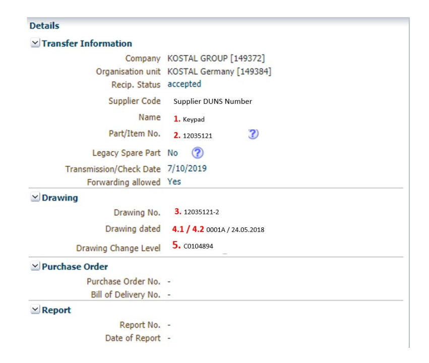
Fig.2 Recipient Data